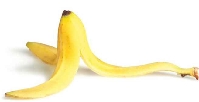
[Develop a creative & entrepreneurial mindset]

instead of a solution to the original problem.